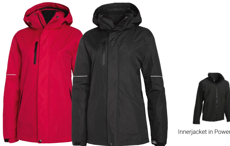
Innerjacket in Powerfleece *

Outershell 100% polyester A.B.T. • Lining 100% nylon/mesh. • Padding Detachable power fleece 100% Polyester