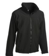
Innerjacket in Softshell.

Outershell 100% polyester A.B.T. • Lining 100% nylon/mesh. • Padding Softshell 96% Polyester 4% Spandex