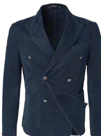
LYNDON DOUBLE-BREASTED BLAZER