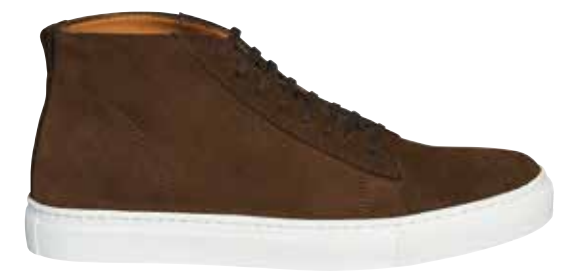
W'S SUNNY SUEDE HIGH TOP SNEAKER

Art.no: 2028 Colour: Tabacco Sizes: 40-46