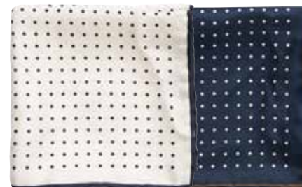
DOT SILK HANKY Art.no: 1574 Printed hanky in silk. Colour: Offwhite/Navy, Navy/White Sizes: 30x30cm