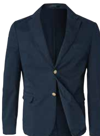
CROYDON CLUB BLAZER