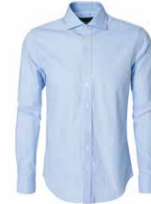
STRIPEFIELD TAILORED SHIRT Art.no: 1527* Easy Care Tailored fit shirt in twofold cotton poplin with cut away collar. Colour: Light Blue Sizes: s-xxxl