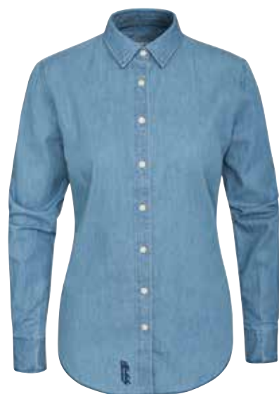
W'S DOVER DENIM TAILORED SHIRT

Art.no: 1564* Tailored fit shirt in real indigo denim twill with cut away collar Colour: Denim Blue Sizes: s-xxxl