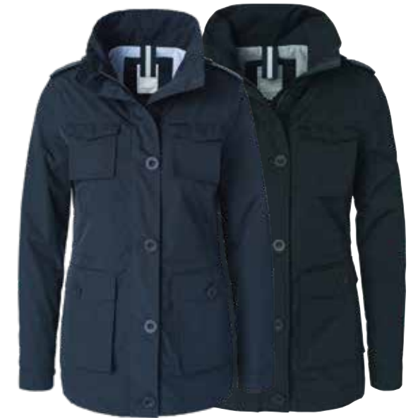
W'S NORWOOD FIELD JACKET