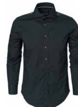
STRETCHFIELD TAILORED SHIRT Art.no: 1641* Tailored fit shirt in a comfortable cotton/lycra blend with cut away collar. Colour: Black Sizes: s-xxxl