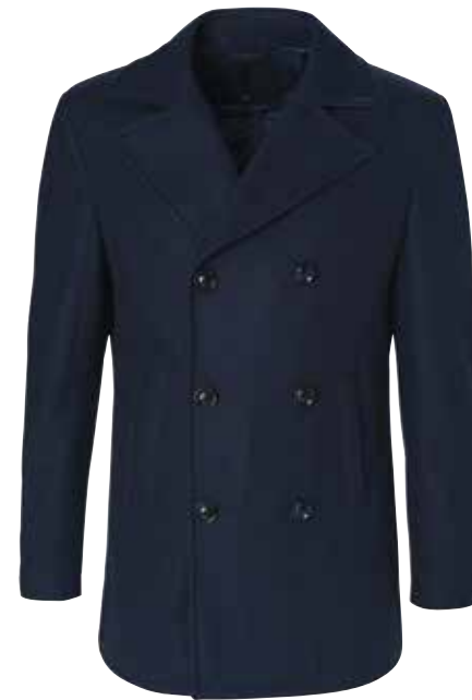
YALE PEA COAT