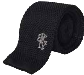
BRKLY TIE Art.no: 1772 Knitted wool tie. 6 cm front blade. Colour: Black Sizes: One size