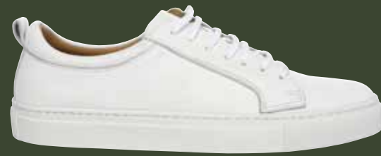
W'S LUIGI LEATHER SNEAKER