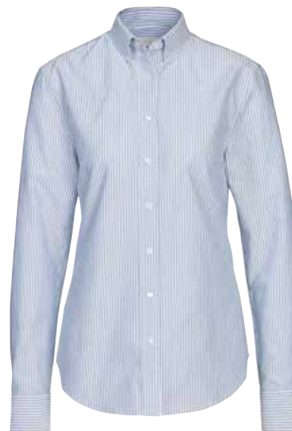
W'S PORTO OXFORD STRIPE TAILORED SHIRT

Art.no: 2012* Regular fit shirt in premium cotton Oxford with button down collar. Colour: Light Blue Sizes: s-4xl