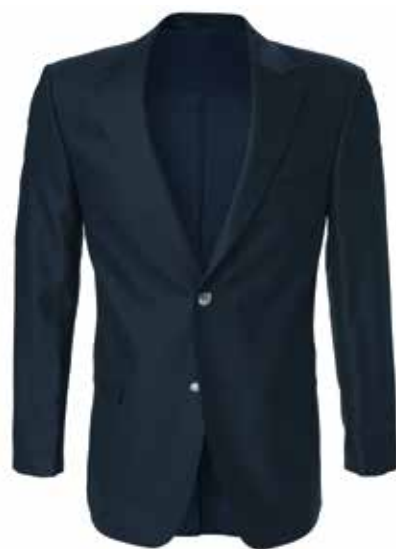
PEMBROKE CLUB BLAZER