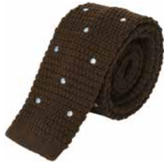
RINGWOOD KNITTED TIE Art.no: 1566 Knitted wool tie with dots. 6 cm front blade. Colour: Brown/Light Blue Sizes: One size