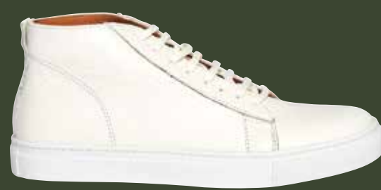
W'S LUIGI LEATHER HIGH TOP SNEAKER