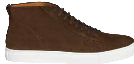
SUNNY SUEDE HIGH TOP SNEAKER

Art.no: 2028 Colour: Tabacco Sizes: 40-46