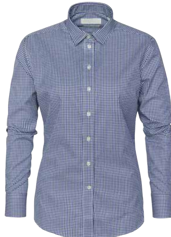
W'S CHECKTON TAILORED SHIRT Art.no: 1987* Non Iron Colour: Navy/White Sizes: xs-xxl