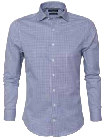
CHECKTON REGULAR SHIRT Art.no: 1985* Non Iron Colour: Navy/White Sizes: s-4xl