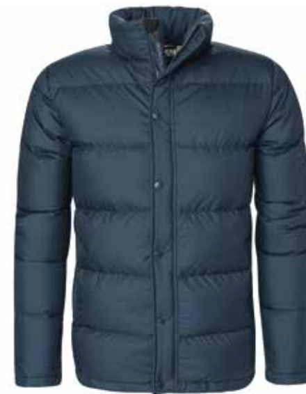
KENSINGTON DOWN JACKET