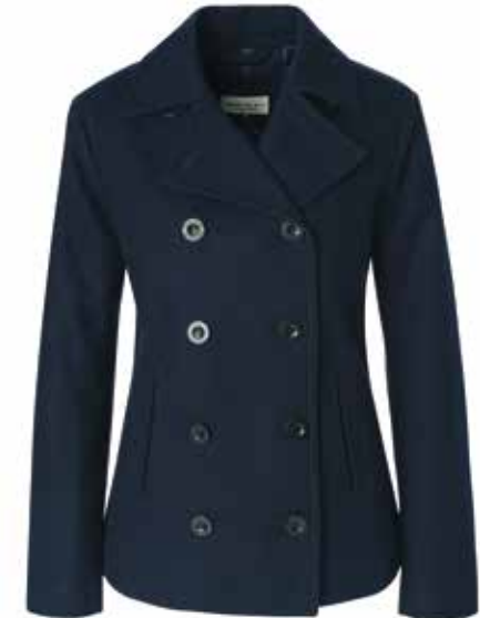
W'S YALE PEA COAT