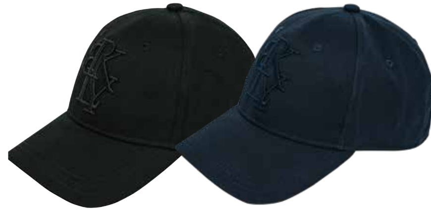
BRKLY CAP Art.no: 1912 Cotton twill cap with tonal 3D embroidery at front. Adjustable velcro strap. Colour: Black, Navy Sizes: One size