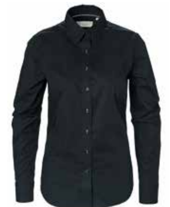
W'S STRETCHFIELD TAILORED SHIRT Art.no: 1642* Shirt in a comfortable cotton/lycra blend with classic collar. Colour: Black Sizes: xs-xxl