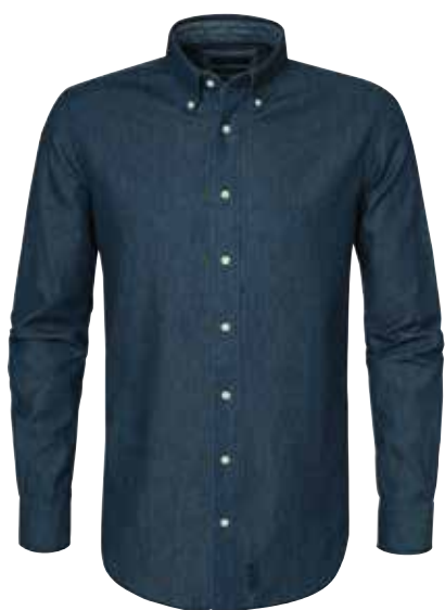
CHILTON DENIM TAILORED SHIRT

Art.no: 1875* Regular fit shirt in real indigo denim twill with button down collar. Colour: Dark Denim Blue Sizes: s-5xl