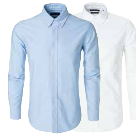
OXFORD TAILORED SHIRT Art.no: 1578* Tailored fit shirt in cotton oxford with button down collar. Colour: Light Blue, White Sizes: m-xxxl