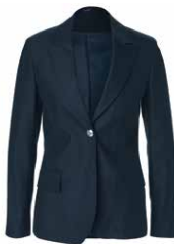
W'S PEMBROKE CLUB BLAZER