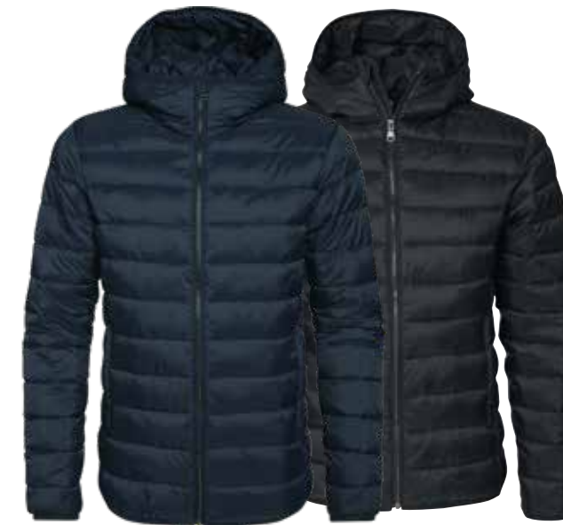
ALFORD HOODED LIGHTWEIGHT JACKET