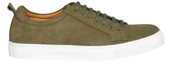
W'S SUNNY SUEDE SNEAKER