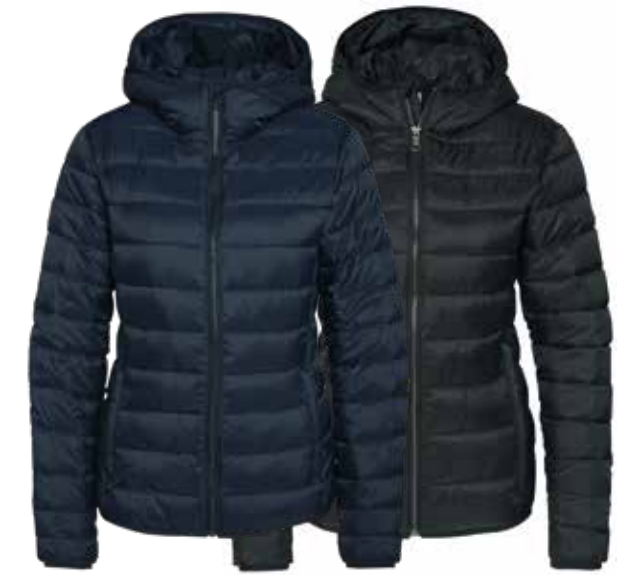
W'S ALFORD HOODED LIGHTWEIGHT JACKET