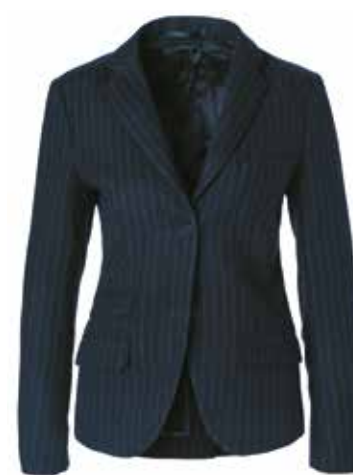
W'S PINSTRIPLE BLAZER