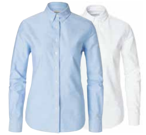
W'S OXFORD TAILORED SHIRT Art.no: 1579* Shirt in cotton oxford with button down collar. Colour: Light Blue, White Sizes: xs-xxl