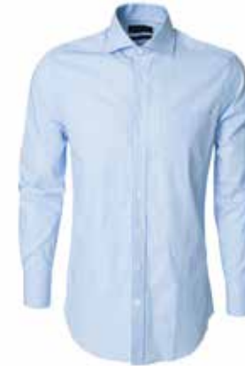
STRIPEFIELD REGULAR SHIRT Art.no: 1526* Easy Care Regular fit shirt in twofold cotton poplin. Cut away collar and chest pocket. Colour: Light Blue Sizes: s-xxxl