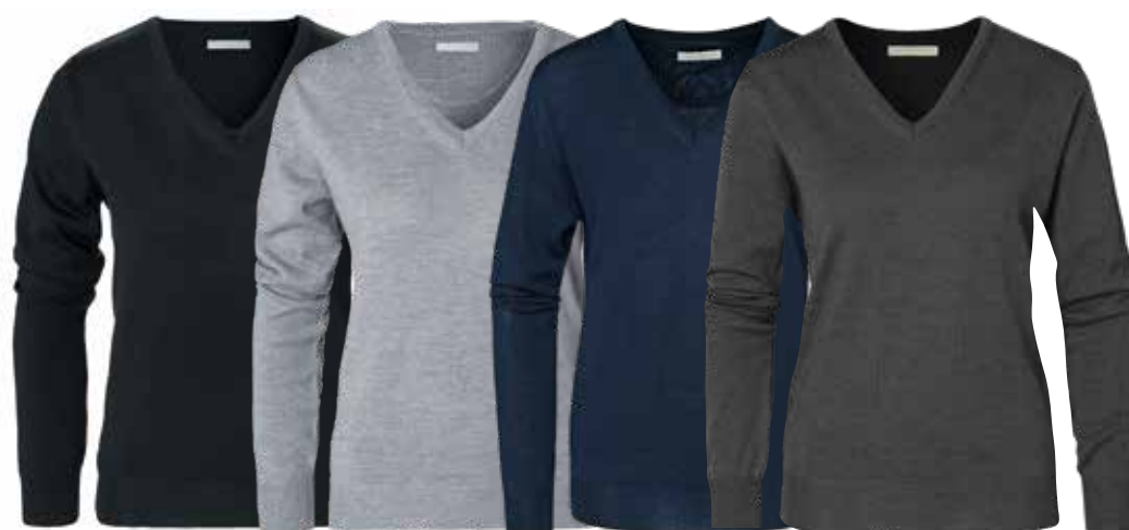
W'S WILTON CASHWOOL V-NECK