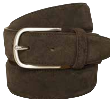
BINGLEY BELT Art.no: 1805 Suede belt with nickel buckle. Colour: Brown Sizes: 85, 95, 105 cm, width 3,5 cm