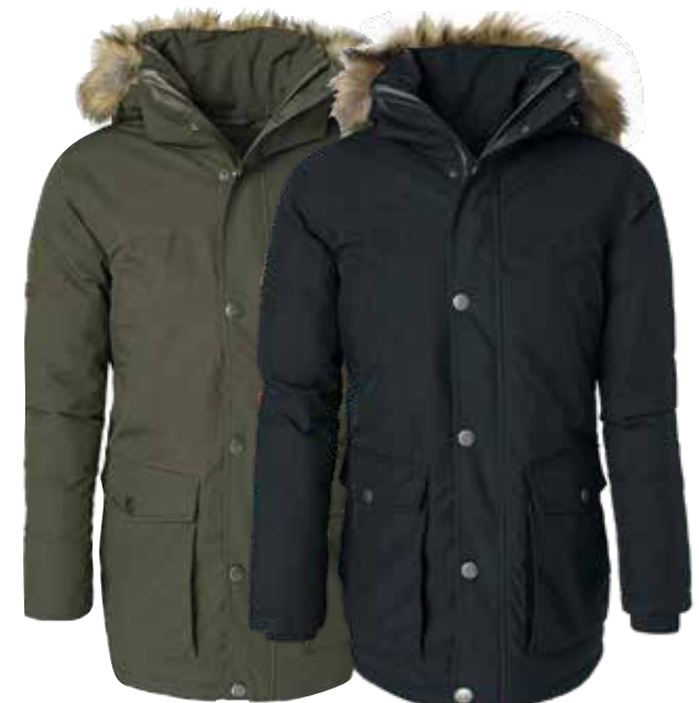
HARTFORD EXPEDITION DOWN PARKA