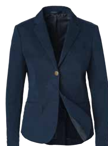
W'S CROYDON CLUB BLAZER