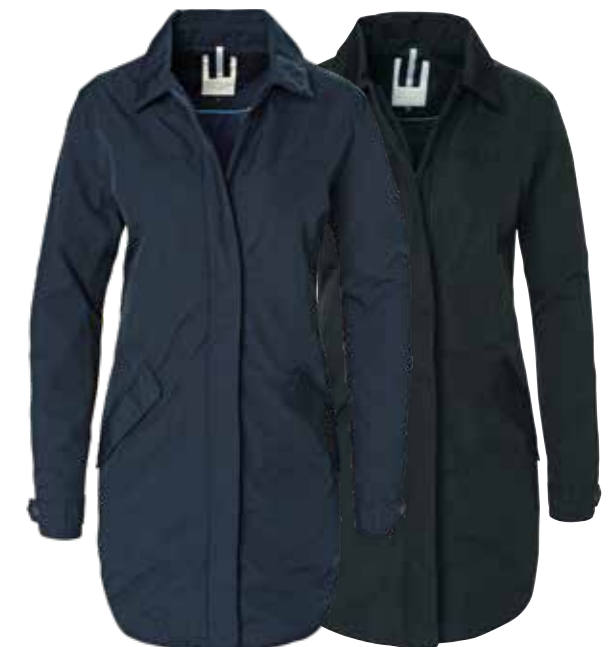
W'S MONROE CAR COAT