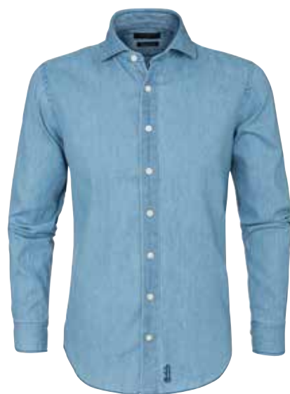
DOVER DENIM TAILORED SHIRT

Art.no: 1737* Shirt in real indigo denim twill with button down collar. Colour: Dark Denim Blue Sizes: xs-xxl