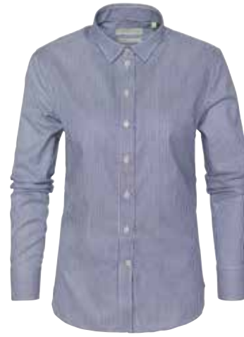
W'S STRIPETON TAILORED SHIRT Art.no: 1984* Non Iron Colour: Navy/White Sizes: xs-xxl