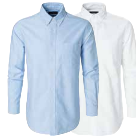
OXFORD REGULAR SHIRT Art.no: 1577* Regular fit shirt in cotton oxford with button down collar and chest pocket. Colour: Light Blue, White Sizes: s-xxxl