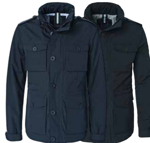
NORWOOD FIELD JACKET