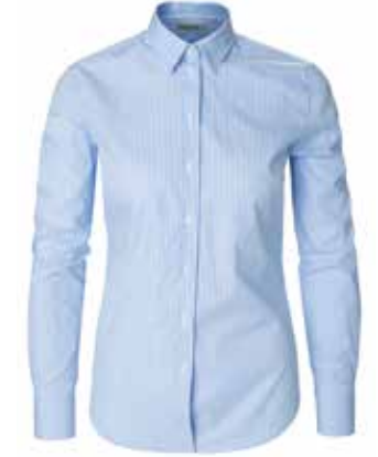
W'S STRIPEFIELD TAILORED SHIRT Art.no: 1528* Easy Care Shirt in twofold cotton poplin with classic collar. Colour: Light Blue Sizes: xs-xxl