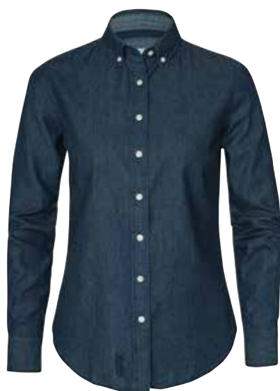
W'S CHILTON DENIM TAILORED SHIRT

Art.no: 1736* Tailored fit shirt in real indigo denim twill with button down collar. Colour: Dark Denim Blue Sizes: s-xxxl