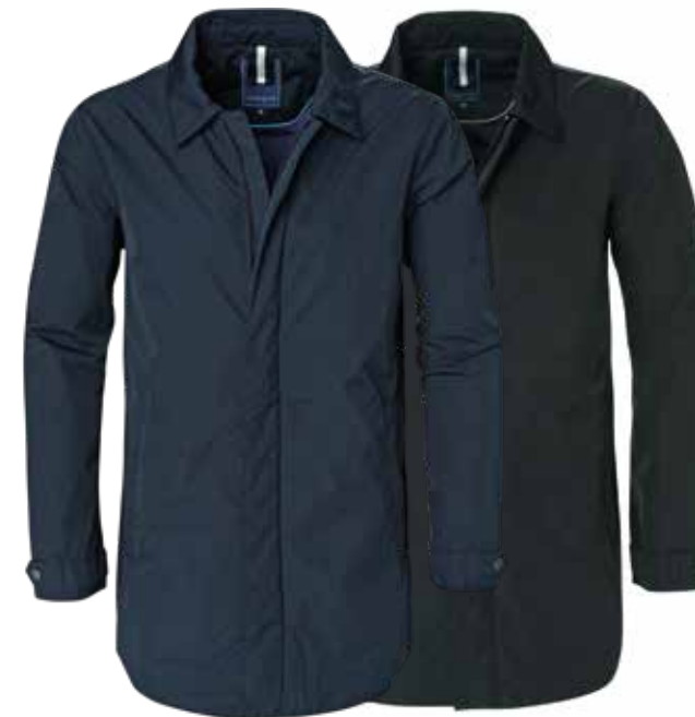
MONROE CAR COAT