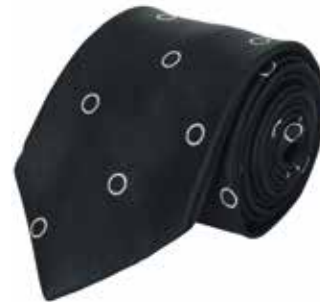
CIRCLE TIE Art.no: 1568 Jacquard woven silk tie. 8 cm front blade. Colour: Black Sizes: One size