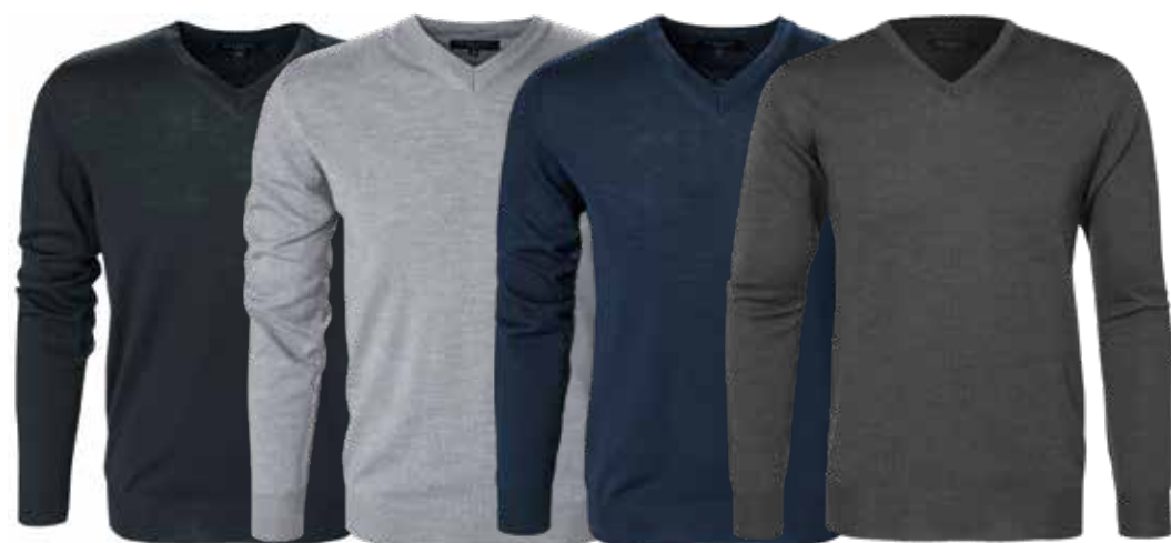
WILTON CASHWOOL V-NECK