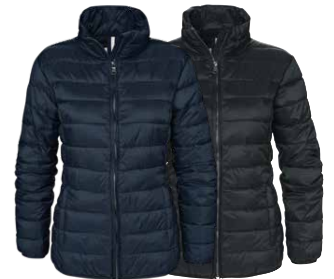
W'S ALFORD LIGHTWEIGHT JACKET