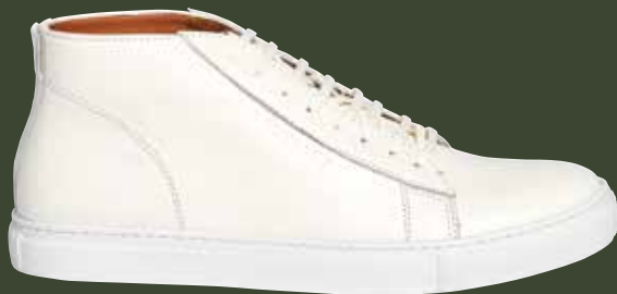
LUIGI LEATHER HIGH TOP SNEAKER