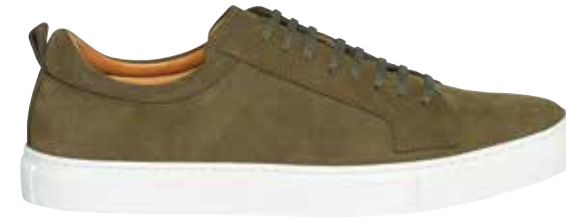
SUNNY SUEDE SNEAKER

Our classic sneaker made of water repellent top quality German suede. Lined with soft calf skin for optimal comfort. Removable insole dressed in calf skin.