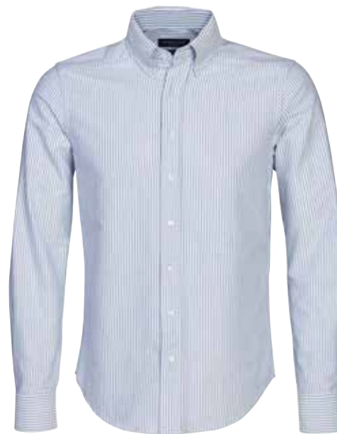
PORTO OXFORD STRIPE REGULAR SHIRT

Art.no: 2012* Regular fit shirt in premium cotton Oxford with button down collar. Colour: Light Blue Sizes: s-4xl