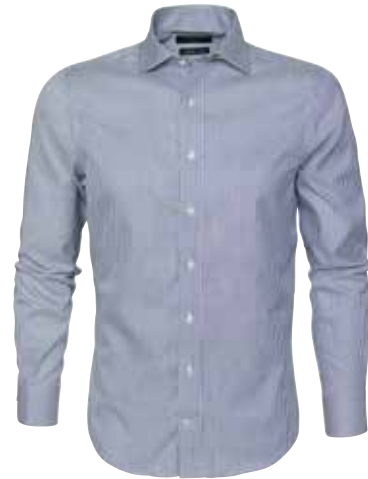
STRIPETON TAILORED SHIRT Art.no: 1983* Non Iron Colour: Navy/White Sizes: s-xxxl