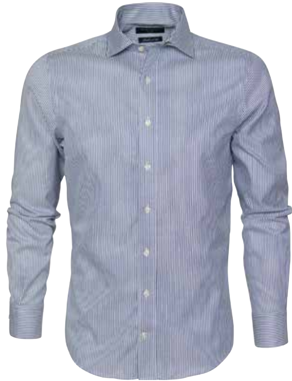
STRIPETON REGULAR SHIRT Art.no: 1982* Non Iron Colour: Navy/White Sizes: s-4xl