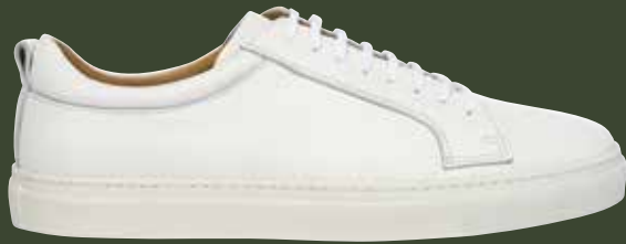
LUIGI LEATHER SNEAKER