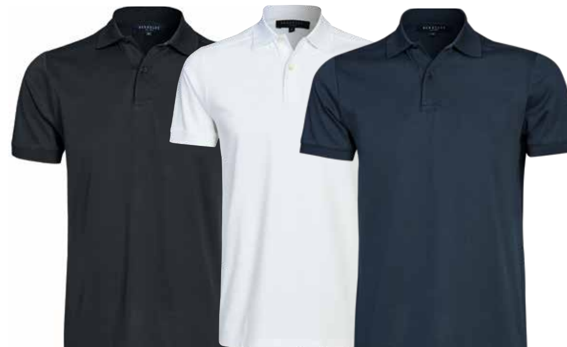
COMMUTER POLO Art.no: 2039 Colour: Black, White, Navy Sizes: s-xxxl