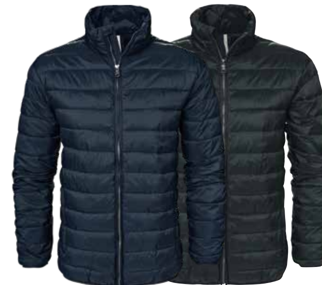
ALFORD LIGHTWEIGHT JACKET